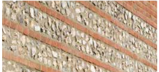
Cedar shingles and flint in detail