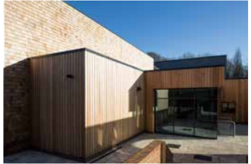
A traditional flint wall connects the new building to the school estate