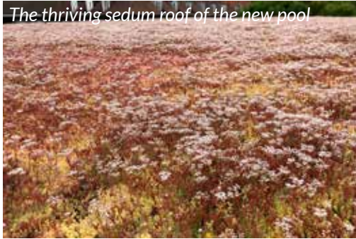
The thriving sedum roof of the new pool

Sussex Heritage Trust Awards 2018, Public and Community - Highly Commended